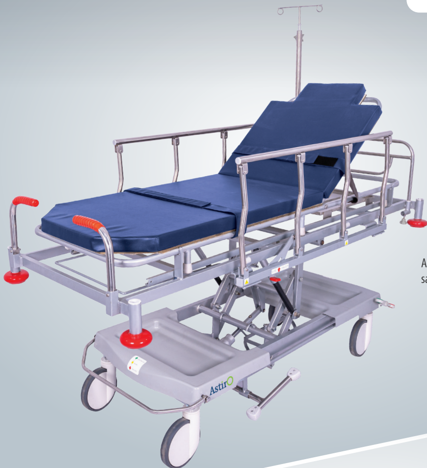
AstirO with SS fully collapsible safety side railing (pair)