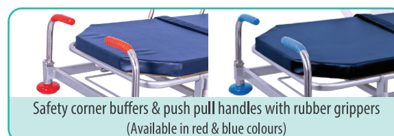
Safety corner buffers & push pull handles with rubber grippers (Available in red & blue colours)