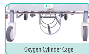
Oxygen Cylinder Cage