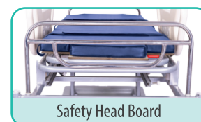
Safety Head Board