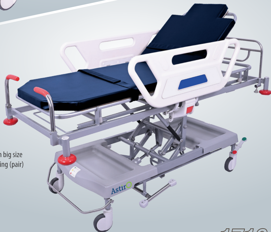
AstirO with big size polymer safety side railing (pair)