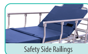
Safety Side Railings